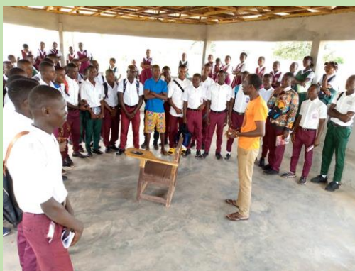
Boys engagement on school campus