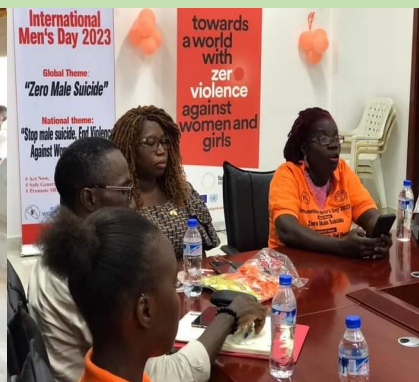
Dialogue with boys, men, women and girls