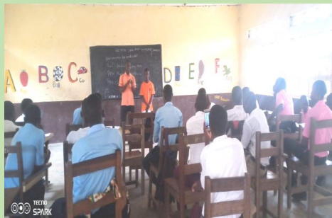
Boys mentorship on campuses

We made significant gains under our Mentorship/ Male engagement program in 2023. We mentored community men, school going boys and traditional leaders on the role and responsibilities of males in promoting and advocating for social justice and gender equality. Over 4,000 men and boys in schools and communities within Lofa, Nimba, Grand Cape Mount, Montserrado, Grand Gedeh, Bong, Margibi counties that have benefited from our interventions and mentorship are now active promoters of gender equality, forerunner for the prevention of SGBV and other abuses. They are actively engaged and involved in reporting cases of violence in schools and communities, this positive behavior of men need to be sustained through more support for the achievement of the SDGS 2023