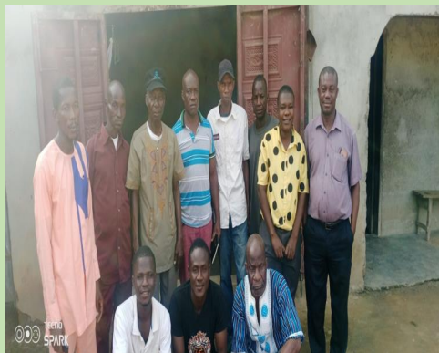
Photo of some Forerunners and peer educators in Nimba on Positive masculinity

Our advocacy initiative calling and reminding government on its international and national obligations to protecting citizens' rights regardless of sex, creed, and status or gender orientation/identity and on policy change remain robust. We did amplify our vigorous advocacy strategy through partnership with both the print and electronic media as well with likeminded civil society organizations (international and national) to engage and advocate against unhealthy laws and practices that threatened human security and undermine national development and stability. With our partnership with the media and international organizations and other CSOs and CBOS, we witnessed the passage of the 2023 drug law, banning of FGM in Liberia, commitment and supports were given to women political participation at all levels, robust response and address were given to SGBV and other violence cases by community members, the local authorities and national leaders. Perpetrators of violence against women, girls and boys in Lofa, Nimba, Grand Gedeh and Montserrado counties were arrested and persecuted.