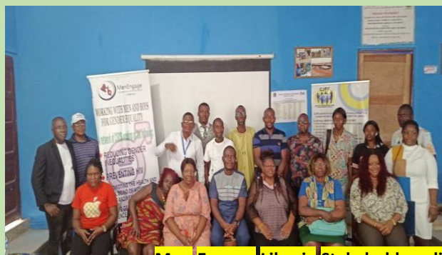
He For She Crusaders Liberia chair's Men Engage Liberia Steering Committee from 2023-2025