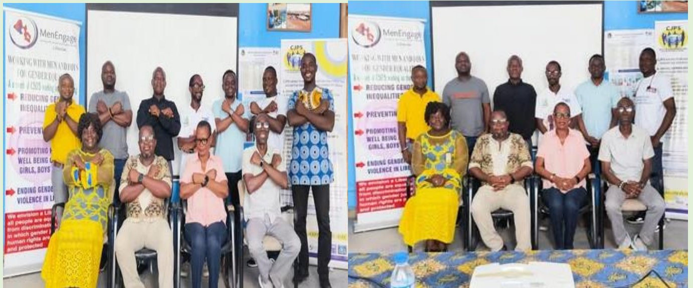
Photos from the partnership meeting held

The Episcopal Relief & Development USA and the Episcopal Church of Liberia Relief & Development held partnership meeting in June 2024 with He For She Crusaders Liberia and Men Engage Liberia on possible men engagement pilot project