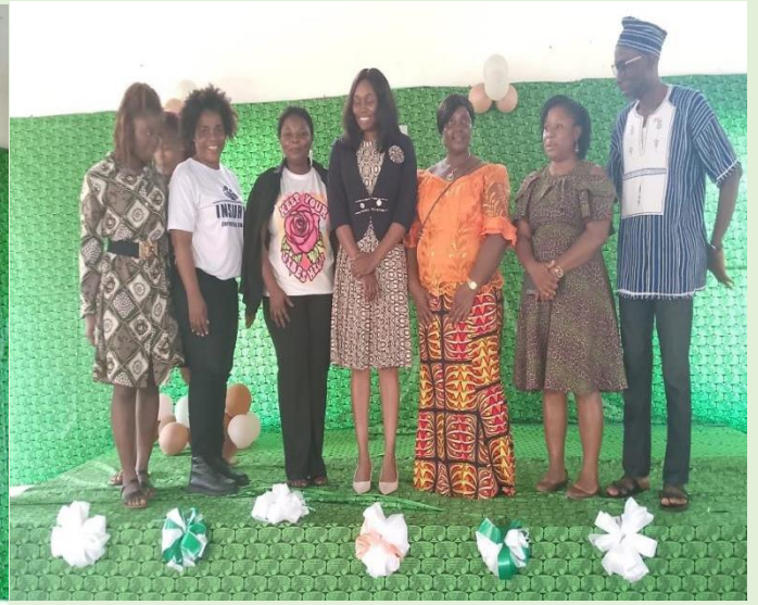
Staff of YEAH and guests during the program

Vocational skill training is crucial to national development/ growth. Liberia has a huge percentage of young people who are seeking for opportunities to improve their lives. The government of Liberia is unable to meet up with the growing demands to provide opportunity for all of the young people of Liberia who are seeking opportunity in vocational skills. In support to the government efforts, some Civil Society organizations are contribution to the said growing demand amongst which is the Youth Education and Humanity of Liberia -- YEAH-- Liberia.