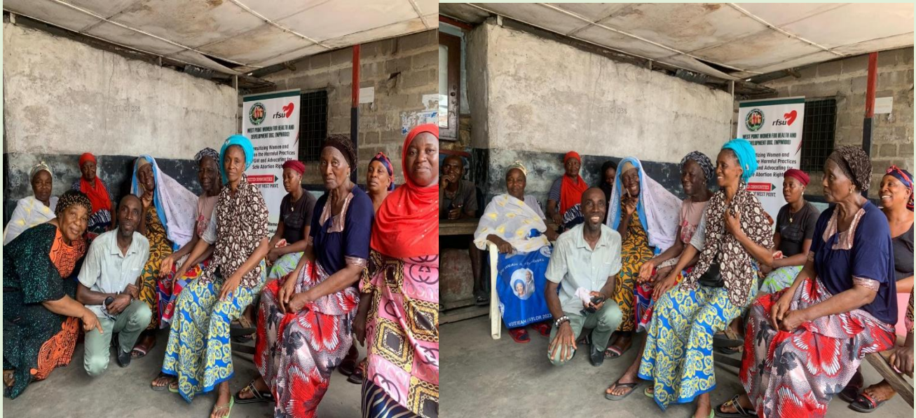
Photo from the monitoring and awareness visit

"We are ready to forgo the practice of FGM, but need sustained alternative livelihood" said some Traditional Women held April 2024