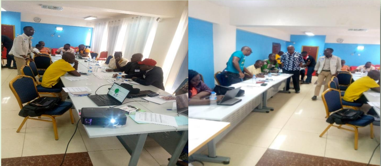
Working session of participations supervised by facilitators

Sexual exploitation and abuse, unfair wages and limited protection for women at the place of work are some of the many constraints women are faced with in many industrial areas of Liberia. Evidence suggests that engaging men as allies in promoting gender equality, challenging harmful norms and creating a more inclusive and equitable work environment is crucial for sustainable change.