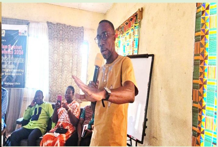
Facilitator providing education